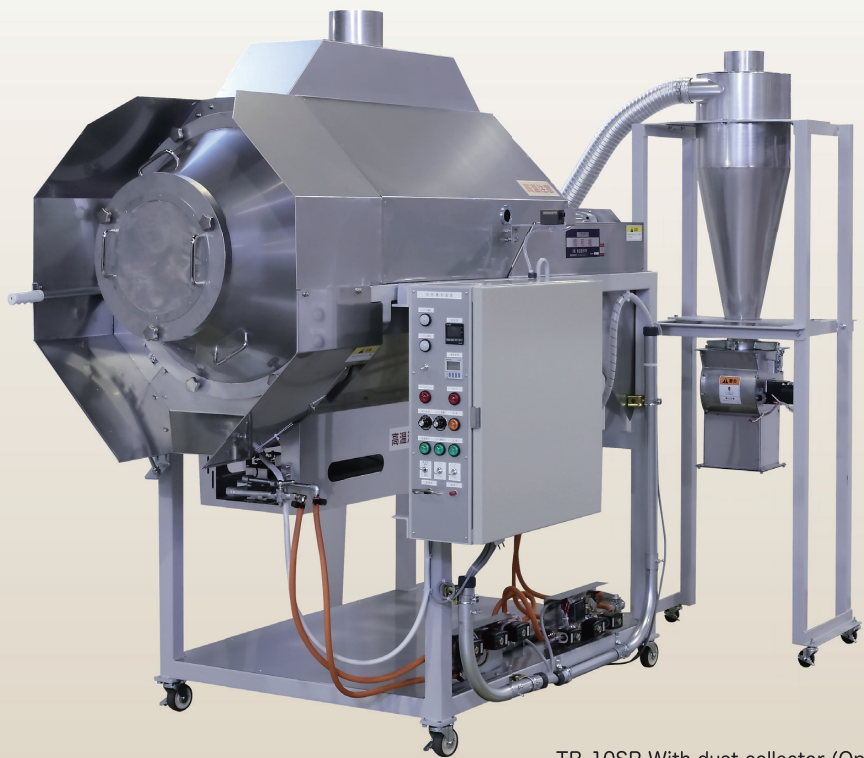
TR-10SP With dust collector (Optional)