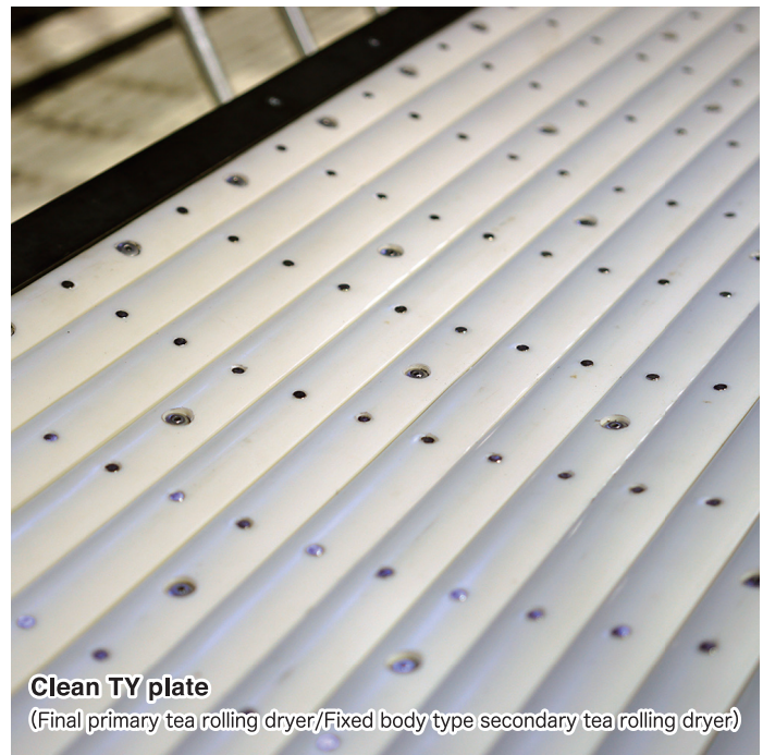
Clean TY plate

(For Tea scattering dryer/Wide primary tea rolling dryer)