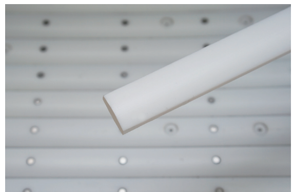
Bottom plate individual shape

※Please be careful of the heat-resisting temperature of the product. Heating without material inside, might cause fire or melting of plates. ※Part of the specifications might be changed for improvement.