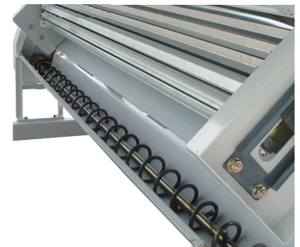
Spilt leaves collector (Only WS-3)