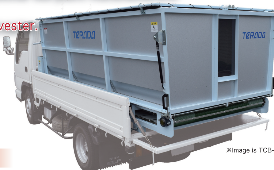
※Image is TCB-35