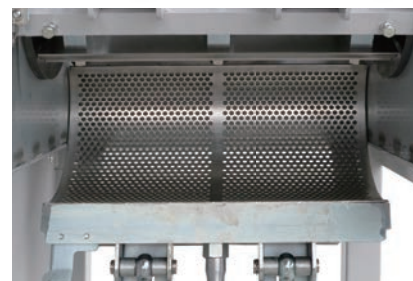
Screen can easily be attached/detached.