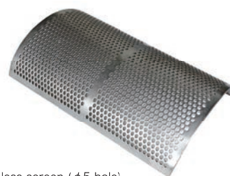
Stainless screen (φ5 hole)